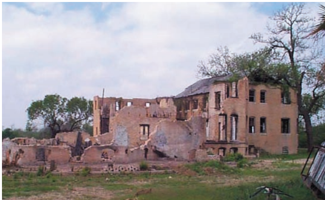
The nonprofit South San Antonio Chamber of Commerce Foundation will focus public investment and private donations to preserve the bath house ruins and well, and operate an interpretive center befitting the site's historical significance.

In the heart of the southern sector cultural corridor, Hot Wells will be an anchor. It will fill a gap by offering lodging option for visitors to the national park, the improved river, the renovated Mission County Park, the Rancho de Charros, the Mission Branch Library, and the Mitchell Lake Audubon Center. All of these attractions appeal to cultural travelers and geotourists looking to combine nature, culture, history, and recreation. Hot Wells will be an oasis destination just a short bike ride or drive away from downtown San Antonio.