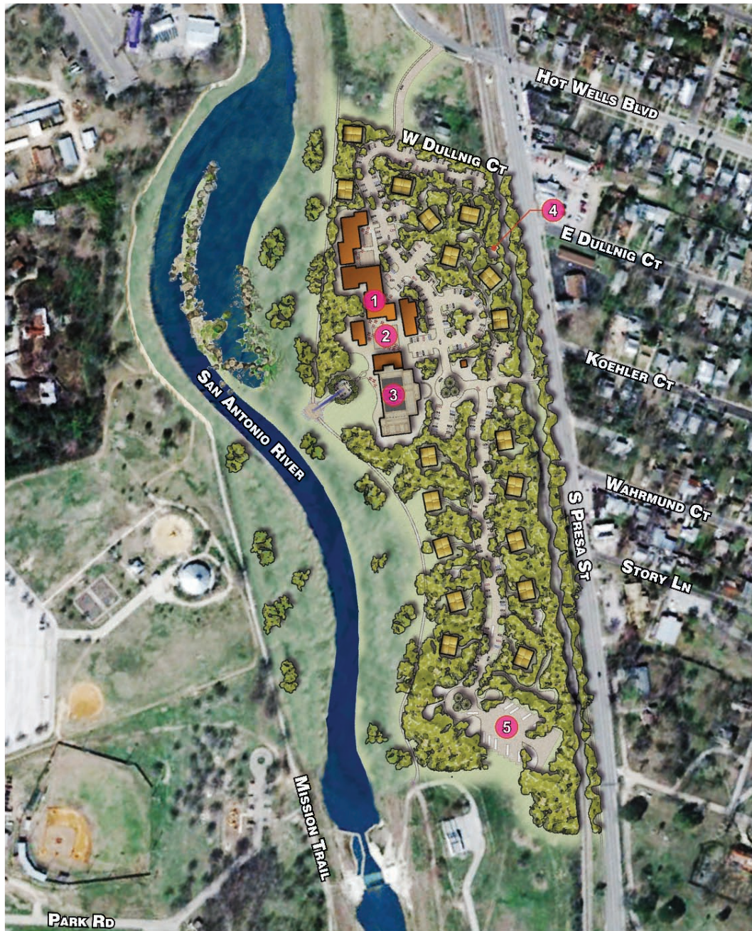
AERIAL SITE PLAN 0' 150' 300' 600'