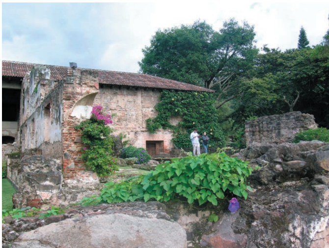
Visitors explore the ruins at Casa Santo Domingo hotel in Antigua, Guatemala. The hotel, built from the ruins of a colonial-era convent, integrates unrestored ruins and colonial artifacts into guests' lodging experience.

Hot Wells is immediately adjacent to the San Juan acequia trailhead. Views of Mission San José across the river, proximity to Missions San Juan and San José, and easy access to the river hike/bike trails