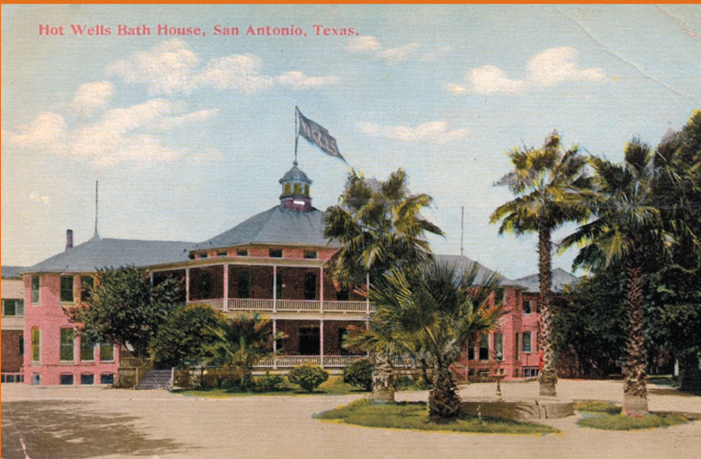
Hot Wells Bath House, San Antonio, Texas.