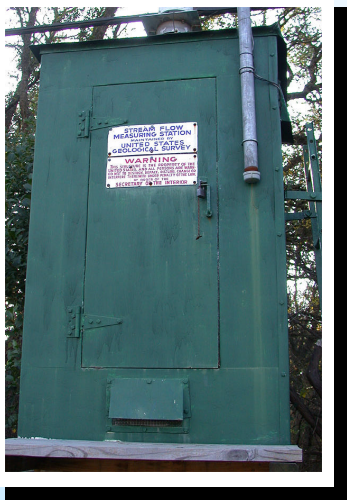
USGS gauging station on Helotes Creek

While there is much we can do to avoid the most serious consequences, floods will always be a part of life in Texas. With little or no warning, the rising waters will reclaim the former wetlands and low areas, and for a brief time take the uplands and hold them until the bulk of the flood passes. Afterward, the torrent will ease, and the water will return, often reluctantly, to its confinement within the river channel, waiting for its next opportunity to escape and go on the rampage again. ★