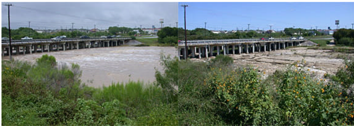
Leon Creek. Normally docile Leon Creek in San Antonio can become a raging torrent when storms strike the Texas Hill Country, known as "flash-flood alley"

ALTHOUGH CANYON RESERVOIR CAPTURED almost 43 billion gallons of floodwater, nearly all of the runoff measured at Cuero and Victoria was the result of the peak rainfall, which occurred downstream of the reservoir. At Cuero, where the San Marcos River joins the main stem of the Guadalupe, runoff was calculated at nearly 600 billion gallons. About 43 percent of the homes in Cuero