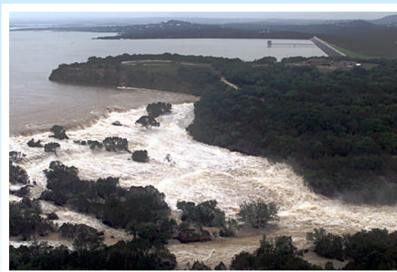
Canyon Reservoir spillway. During the flood of 1998, peak rainfall occurred downstream of Canyon Reservoir. In July of 2002, record rains filled the reservoir to capacity and the emergency spillway was used for the first time.